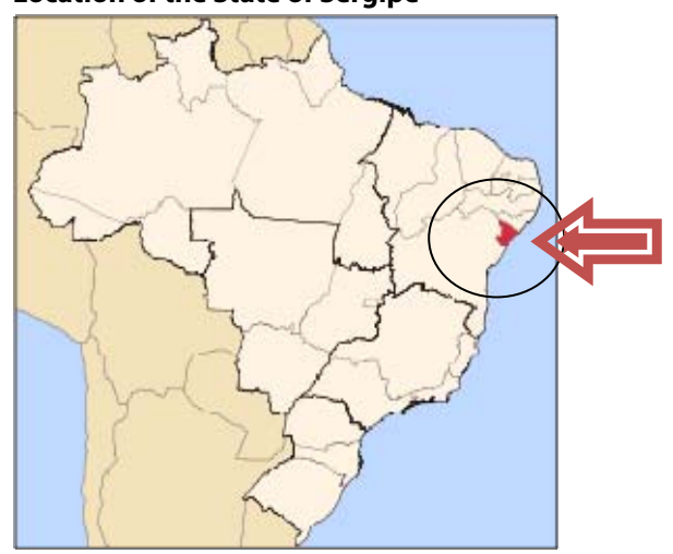
Location of the State of Sergipe

In a brief presentation of the municipalities of Estância, Indiaroba and Lagarto, it is worth noting that only in Estância does the majority of the population live in urban areas (86 per cent); this is higher than the state average (71 per cent). Indiaroba and Lagarto have a