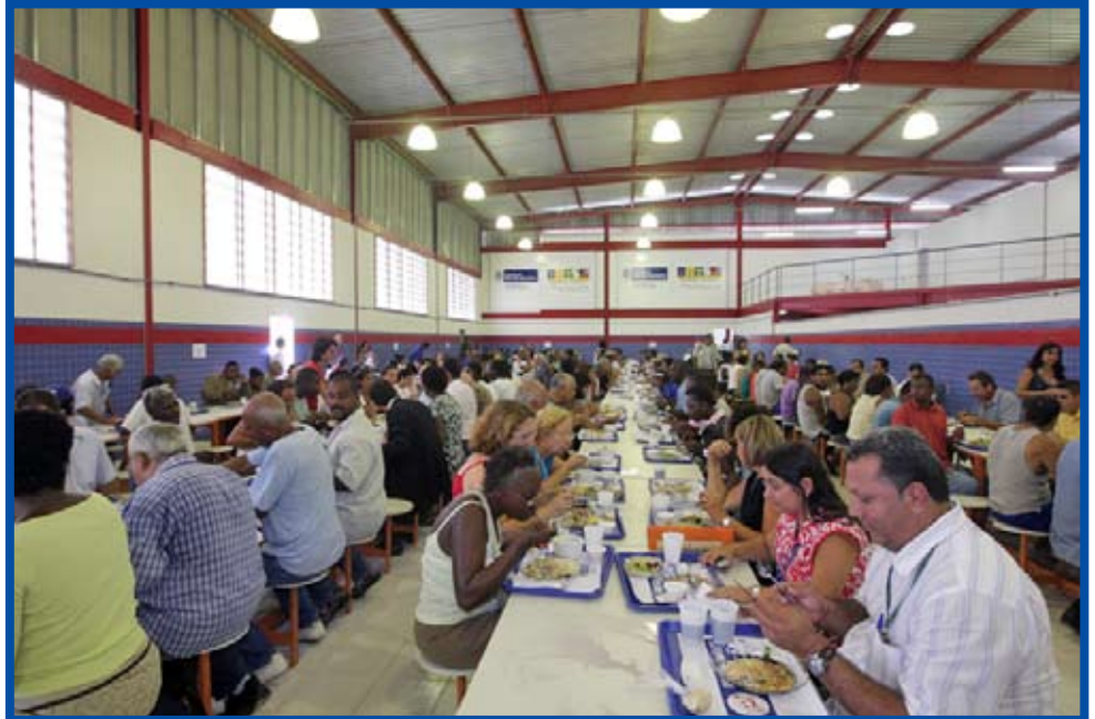
Inauguration of Low-budget Restaurant in Irajá - Rio de Janeiro - March 13 th

The CREAS initiative offers services related to children and adolescents who are subject