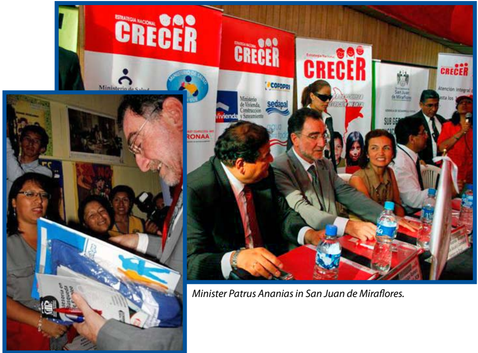
Minister Patrus Ananias in San Juan de Miraflores.

As regards Latin America, Peru will organise a working group to integrate its social programmes into a single system, following the example of Brazil's social protection system. This was the result of a two-day official visit to Peru by MDS Minister Patrus Ananias earlier this year. He joined President Alán García in a working meeting with Peruvian authorities, and visited programmes in metropolitan Lima area and in the countryside.